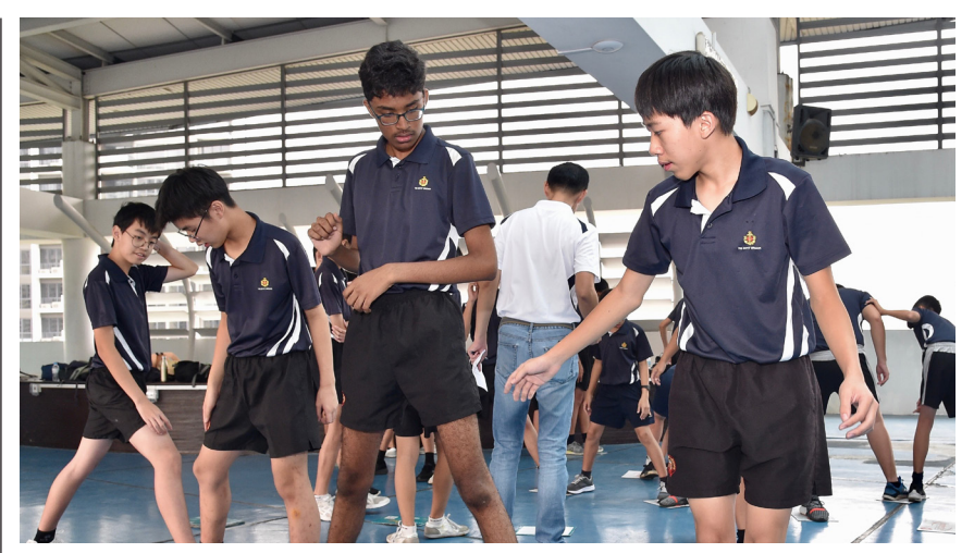
Fiery Furnace Station

The Boys could choose from eight game stations to tackle but were required to complete an additional five mini-preparation games in order to participate in the final war game.