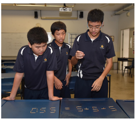
Selection to Serve the King Station