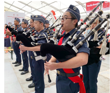
Catch the rest of the BB Companies in action at National Day observance ceremonies across the island in our Social Media Features on the next page!